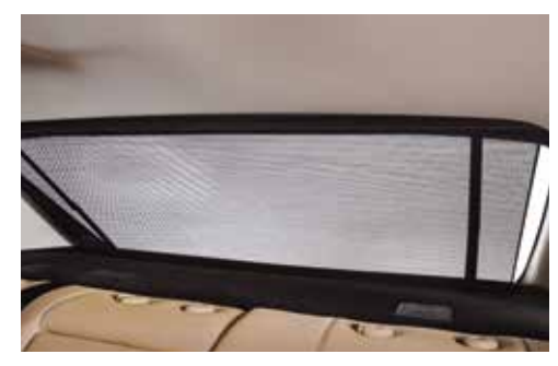
Powered rear curtain