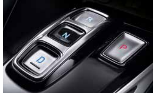
Shift-by-wire 6-Speed automatic transmission