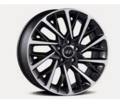
18" Alloy wheel