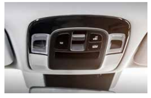
Front personal LED Lamps