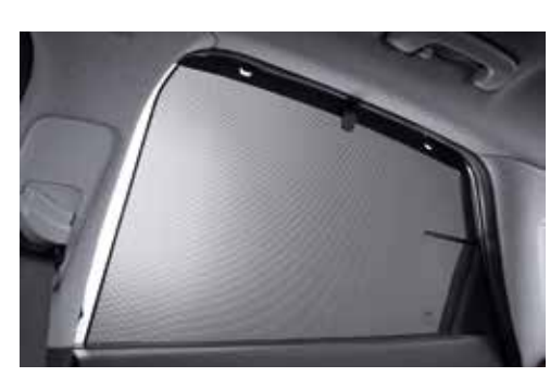
Rear window curtain