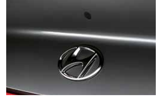
Rear camera and concealed boot lid button