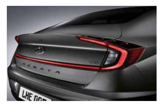
Horizontal LED Rear Tail lights with LED turn signal lamps

LED headlamps (Projection type)/Daytime running light (LED)