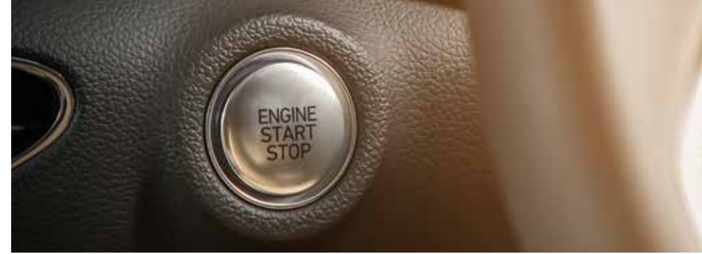
Push start button

Wireless smartphone charging system Lost or misplaced recharging cords? The cord is a thing of the past with the wireless smartphone charging system that ensures your phone will never go dead.