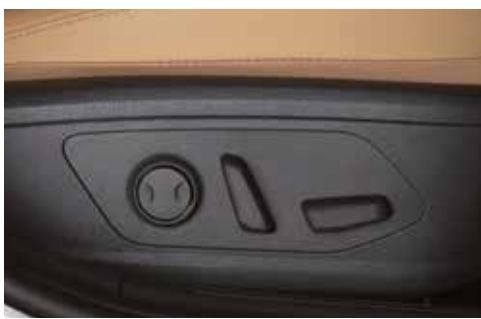
10-way powered Driver Seat + 4 way powered Passenger Seat