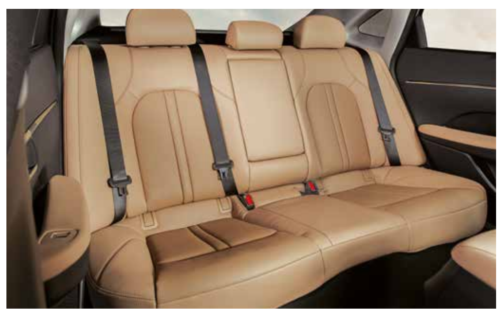
Rear seat with armrest