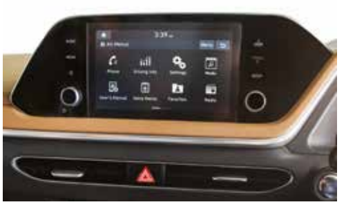
8" Floating infotainment system display