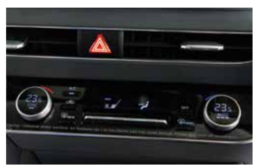
Dual zone automatic climate control