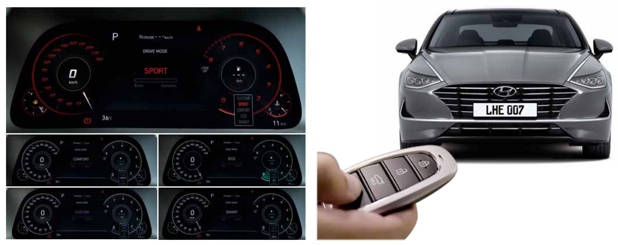
12.3 inch full LCD cluster/Integrated driving mode (Comfort/Smart/Eco/Sport/Custom)

Step inside and discover an interior that engages and satisfies all the senses. The cabin is a visual feast projecting elegance and warmth while delivering a rich tactile experience. The dials of the SuperVision cluster come to life with stunning clarity and show impressive depth. Numbers and batons are crisp and clean with the gauges scoring big points for their elegance and functional simplicity.