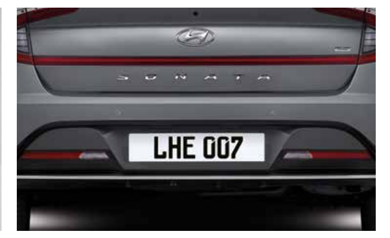
Sporty rear bumper/Rear parking sensors/Rear camera