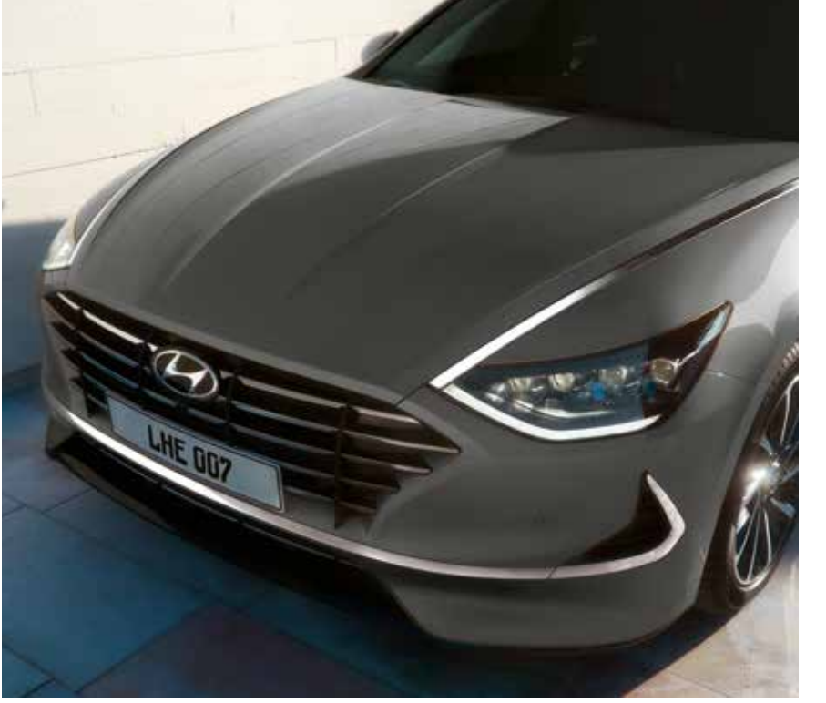
Radiator grille/LED daytime running lights (DRL)/LED Projection headlamps/front parking sensors

Sonata's high style not just sparks the emotions but also delivers high rewards with innovative design features like the gradient hidden light technology, a sure conversation starter that adds to Sonata's mystique. Sonata's high-tech image is reinforced with LED rear combination lamps and available full-LED front lighting. For a statement that expresses high performance, Hyundai offers an 18-inch alloy wheel package and premium Pirelli tires.