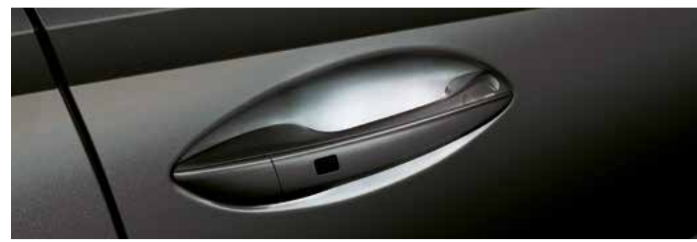
Smart door handle with welcome light